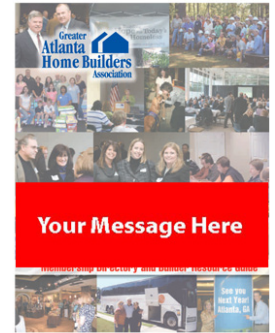
Sample Belly Band

You can also ensure your message is the first readers see by wrapping it around the 2011 Membership Directory and Resource Guide with a belly band. Since readers must detach the belly band to open the publication, your full-color ad is ideally placed to be noticed. This is an exclusive advertising opportunity, as only one belly band will be sold.